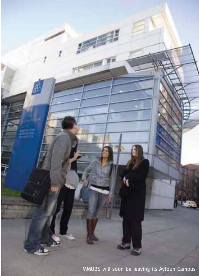
MMUBS will soon be leaving its Aytoun Campus