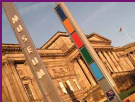
World Museum Liverpool