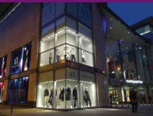
The stylish Metquarter in the heart of Liverpool

(Official Tourism Website for the Liverpool City Region)