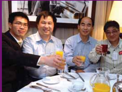
Business over breakfast