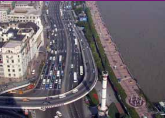
Liverpool businesses head east to Shanghai to build trade links