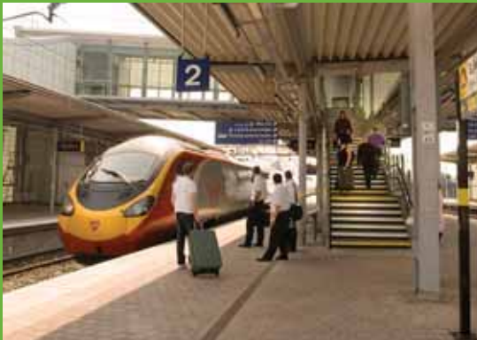
Liverpool South Parkway