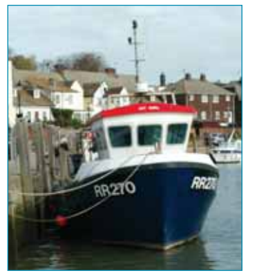
The Creek at Queenborough