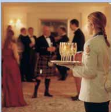
Champagne reception on board