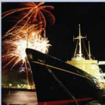
Fireworks over Royal Yacht Britannia