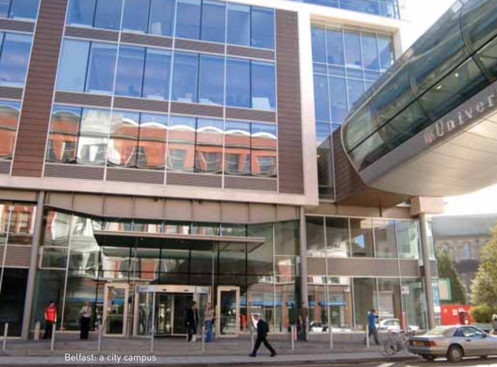
Belfast: a city campus