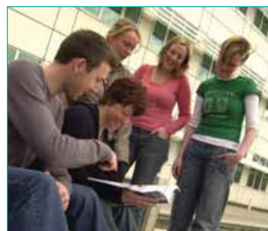
A relaxed atmosphere for staff and students

The University of Ulster helps business and industry in Northern Ireland and beyond.