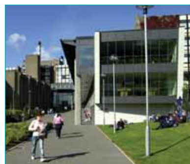
The Learning Resource Centre at Jordanstown