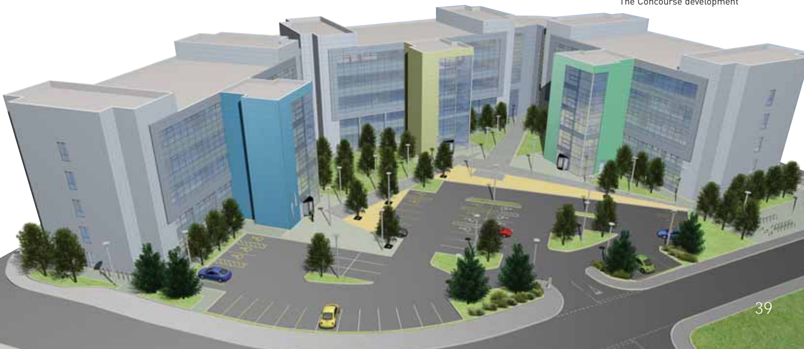
Aerial view artist's impression of The Concourse development

Containing approximately 10,000 sq ft of space to let on each floor of its five floors, each building will be capable of accommodating bespoke hi-tech, flexible workspace. ►