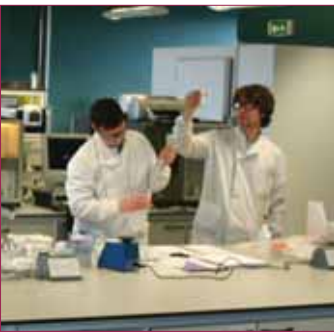
Wet labs: Doing business with Science

NISP is set to play a major long-term role in the local economy.